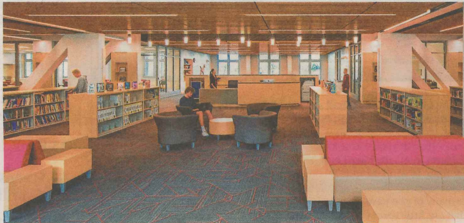
A library and media center occupies the first floor of Point Loma High School's new three-story building.