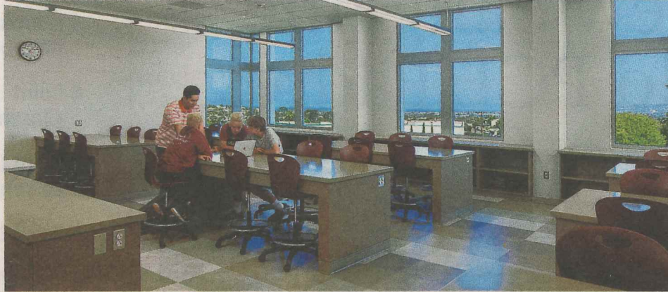
Point Loma High School's new three-story building includes 10 classrooms on both the second and third floors.

Point Loma High School has completed its largest modernization project since it first opened in 1925.